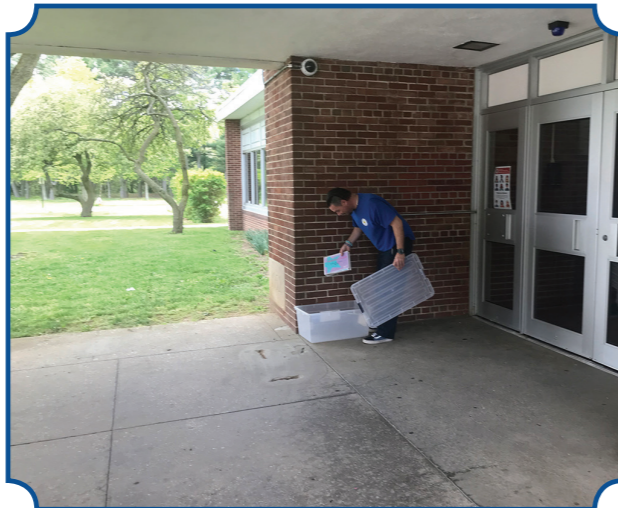
To limit indoor visitors, each school has a "drop box" outside the main entrance, where parents can drop off items for their children.