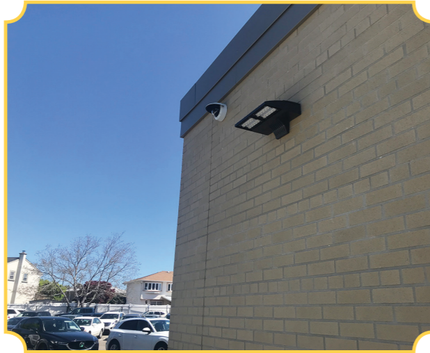
The district has installed exterior security cameras on all buildings. The district currently has 201 external cameras.

A full copy of the districtwide School Safety Plan is available upon request at central administration in the Office of the Superintendent of Schools or can be viewed online under the district tab at www.hicksvilleschools.org .