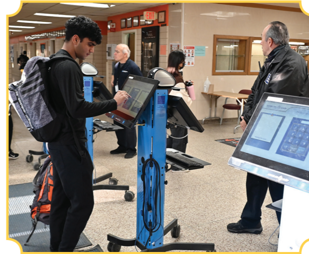
A Hicksville High School student scans his identification card upon entering the building using the ScholarChip program.