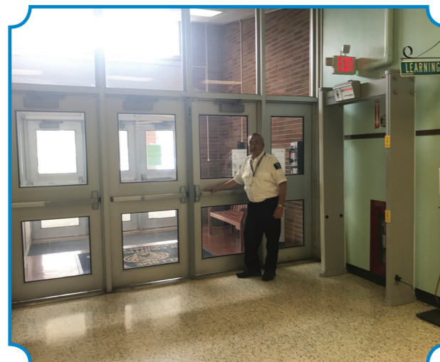
The district has increased the number of security guards stationed at each building.